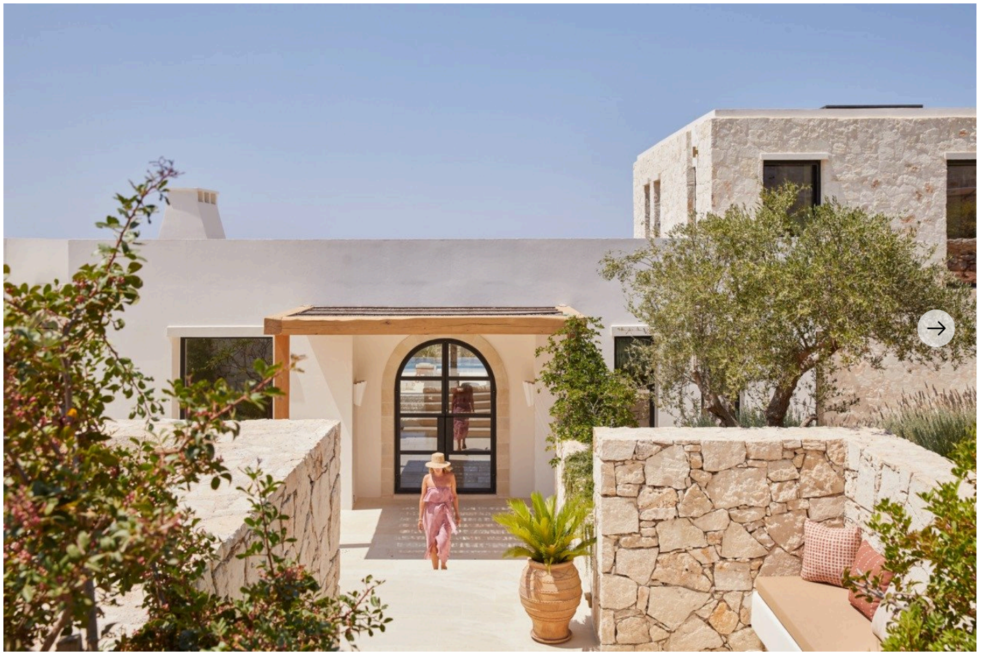
PHOTO 1 OF 3 The property's exterior shows stone walls and white plastered surfaces with an arched doorway leading to interior space.