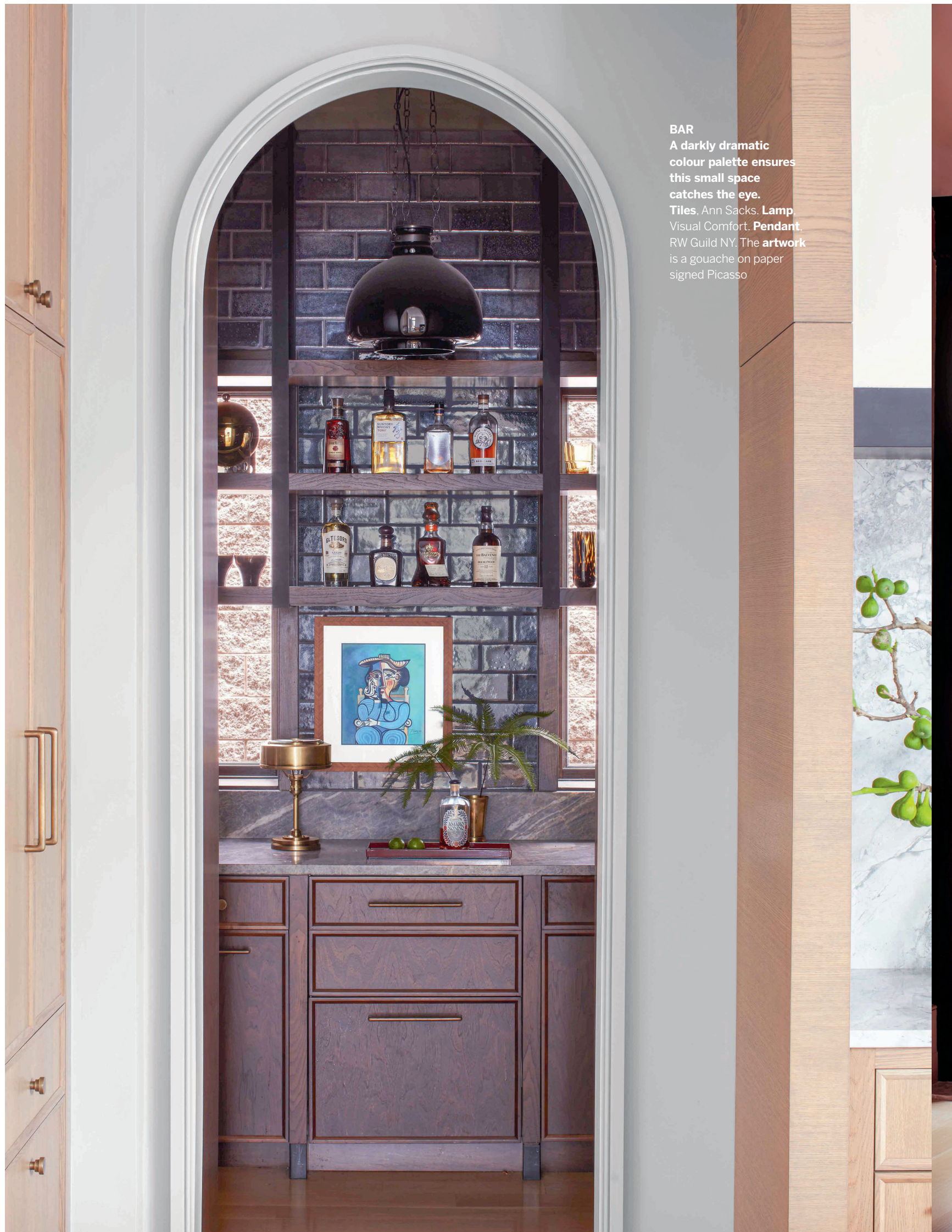
BAR A darkly dramatic colour palette ensures this small space catches the eye. Tiles , Ann Sacks. Lamp , Visual Comfort. Pendant , RW Guild NY. The artwork is a gouache on paper signed Picasso