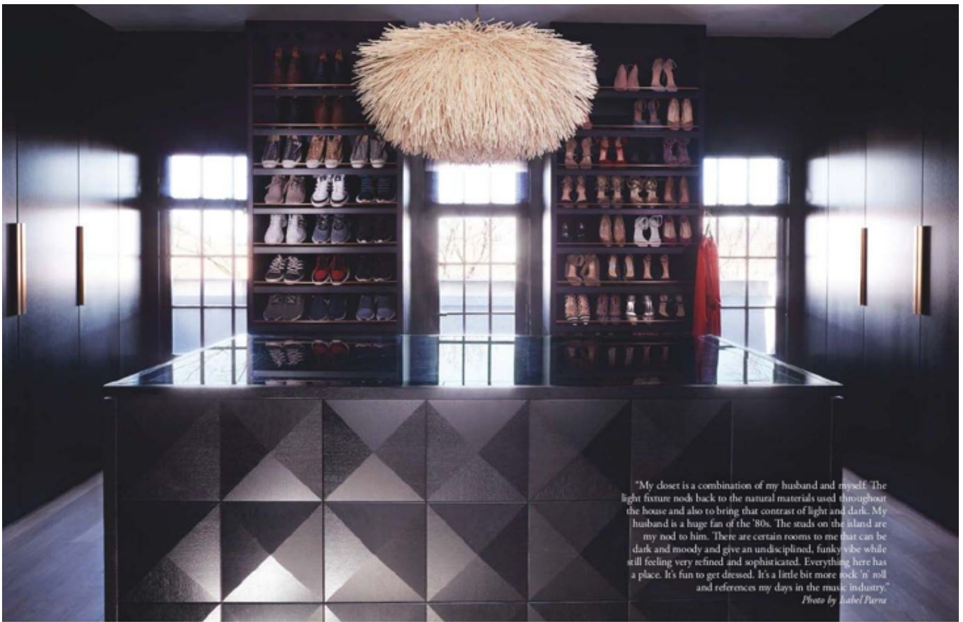
"My closet is a combination of my husband and myself. The light fixture nods back to the natural materials used throughout the house and also to bring that contrast of light and dark. My husband is a huge fan of the '80s. The studs on the island are my nod to him. There are certain rooms to me that can be dark and moody and give an undisciplined, funky vibe while still feeling very refined and sophisticated. Everything here has a place. It's fun to get dressed. It's a little bit more rock 'n' roll and references my days in the music industry."