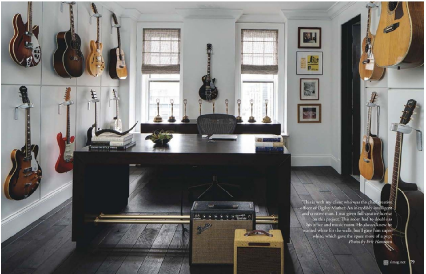
"This is with my client who was the chief creative officer of Ogilvy Mather. An incredibly intelligent and creative man. I was given full creative license on this project. This room had to double as his office and music room. He always knew he wanted white for the walls, but I gave him super white, which gave the space more of a pop."