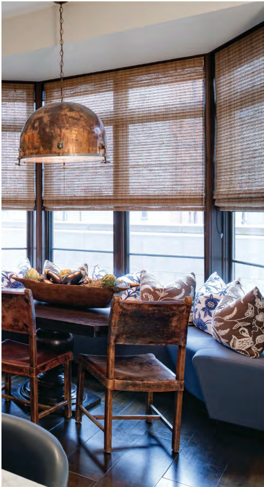
COMMAND CENTRAL A De Giulio-designed kitchen with deep quartzite countertops and backsplash hosts three toddlers day in and out. Custom barstools were replicated to mimic those seen in a Paris bistro; vintage leather seating scored at a Paris flea market pulls up to the built-in banquette.

conversation about the urban Mediterranean home Giannoulis was building right across the street—led to Lewis coming on board as co-pilot for the project. The imminent partnership was recently made official as Lewis Giannoulis Interiors ( lg-interiors.com ).