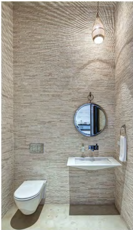
SHOWER POWER The master bath is outfitted with dueling Dornbracht rainshowers, a Duravit tub and sinks, and enormous travertine marble slabs. Rohl and THG fixtures and Murano glass sconces act as accessories to the well-outfitted room. Left: The penthouse powder room walls sport natural rock-face tile and a sleek Duravit sink and toilet.

Upstairs, floor-to-ceiling closets were outfitted with envious details and storage precision, and bath fixtures, pulls and knobs were all chosen with care and craft. Three sets of washer-dryers help get the job of the family's toddler trio done on every level. The ornamental plaster ceilings, enormous travertine slab walls in the room-size showers and custom sofas for the top-floor family room spare no expense. The roof deck with open windows acts as a welcome outdoor invitation for family gatherings. It's the thoughtful detail behind every personalized choice that makes it a place people want to spend time.