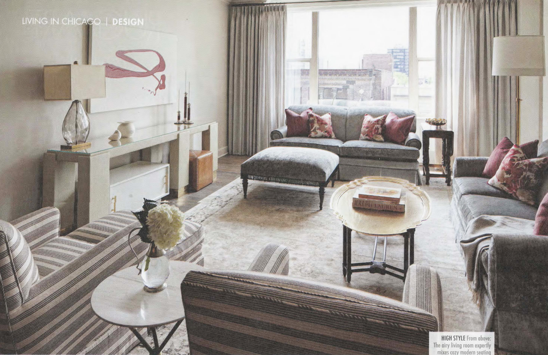
HIGH STYLE From above: The airy living room expertly mixes cozy modern seating with heirloom accents; a light fixture from Ochre in the foyer makes a grand statement, setting the tone for the rest of the space.